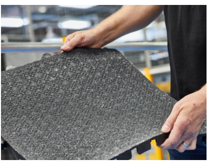
Grit Finish for Oily environments